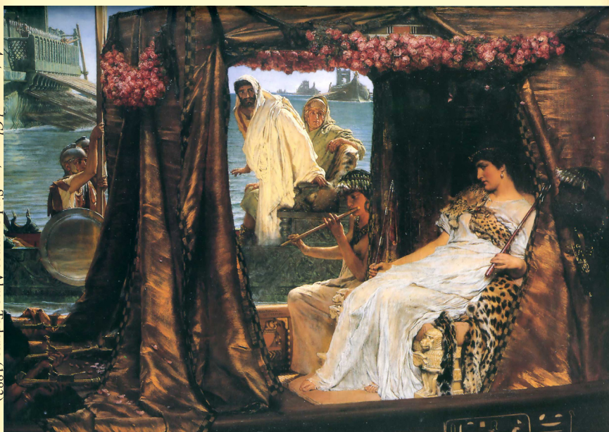
Antony and Cleopatra, Sir Lawrence Alma-Tadema (1883)

Publius Stabo is in a quandary. He was about to throw in his lot with Octavian after the defeat of Marc Antony at Actium, but what if Marc Antony and his Egyptian allies truly do have some sort of secret weapon? Do they truly have something that could crush Octavian's forces outside the gates of Alexandria or take the fight back to the heart of Rome itself? Stabo hoped to keep the matter quiet until he had personally met with the survivors of the battle and made a decision. Word has spread quickly through his court about their presence, however, and all the local Roman and Macedonian nobles demand an audience to argue their case for Octavian or Marc Antony.